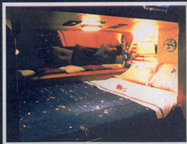
Private Owners Aft Stateroom